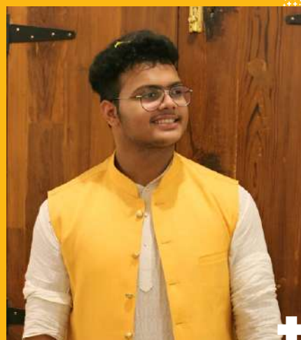
SAURABH DHARMADHIKARI BA Photography

Currently, students are pursuing education in over 150 programmes at MIT World Peace University. Located in the picturesque city of Pune, the MIT-WPU campus is surrounded by key civic infrastructure and sprawls over 65 acres of lush green campus.