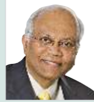
Dr. Raghunath A. Mashelkar Chairman, Advisory Board, MIT-WPU Padma Vibhushan, Eminent Scientist, President, Global Research Alliance