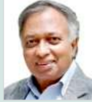
Dr. Vijay P. Bhatkar Executive Chairman, Advisory Board, MIT-WPU Padma Bhushan, Educationist, Eminent Computer Scientist