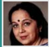
Rohini Hattangadi Renowned Actor CHAIRPERSON